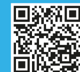
Yayasan Bank Rakyat Education Loan