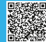
Tan Sri Jeffrey Cheah Entrance Scholarship