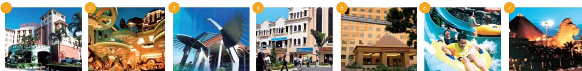
1 Sunway Medical Centre 2 Sunway Resort Hotel & Spa 3 Sunway University 4 Sunway Metro Commercial Shops 5 Pyramid Tower Hotel 6 Sunway Lagoon 7 Sunway Pyramid Shopping Mall